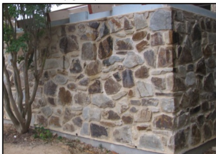
Above: A1 Stonemasonry (laid vertical)