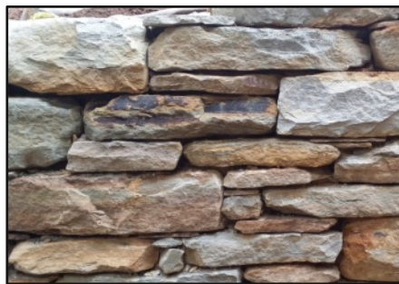
Above: Custom Stonework