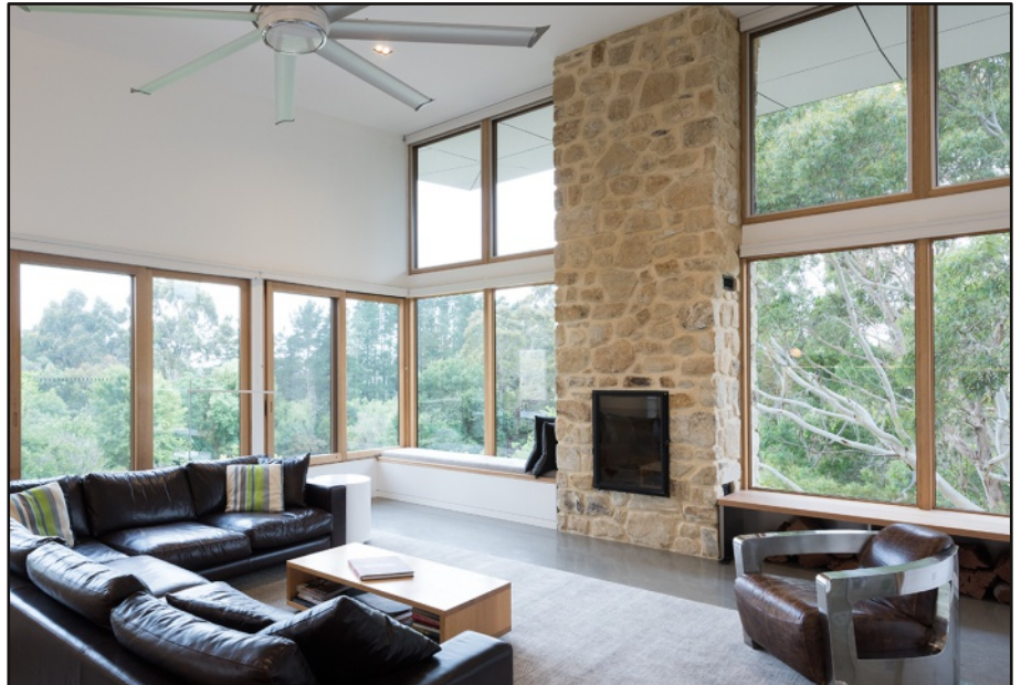
Above: O'Brien Quality Stone Restoration

If you are looking for a stonemason to lay the stone please visit our website for a list of names and contact information. Any of them will be able to assist you with your next project.