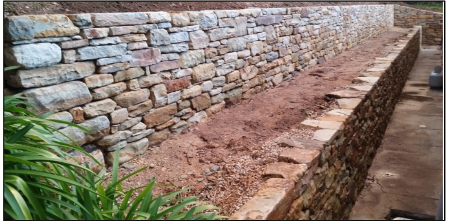
Above: Custom Stonework (laid horizontal)