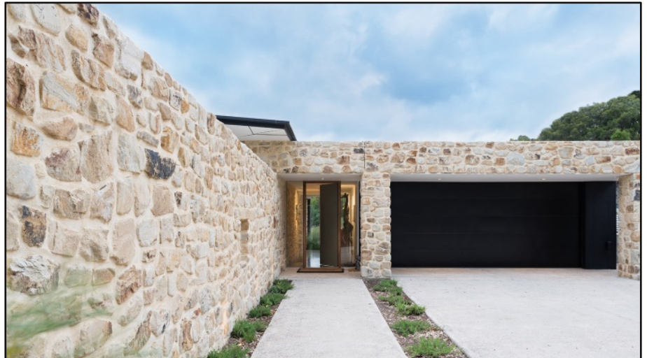
Above: O'Brien Quality Stone Restoration