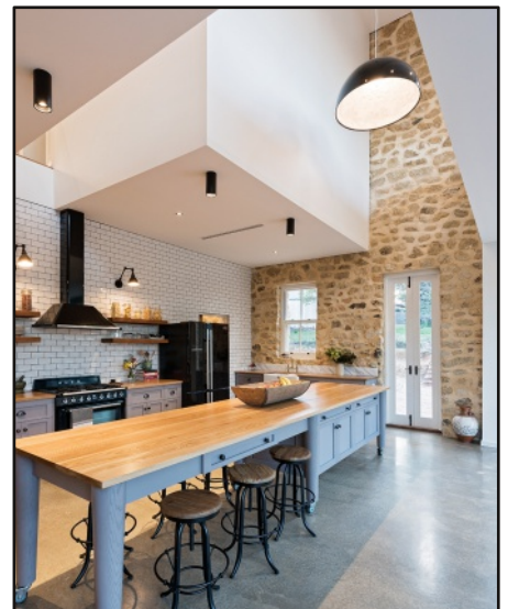
Above: G & SR Mitchell Stonemasons