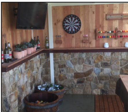
Above: Private Residence